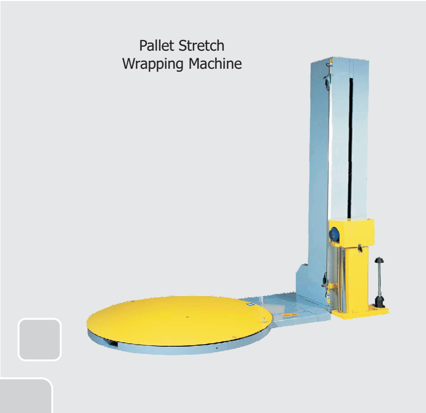
Pallet Stretch Wrapping Machine